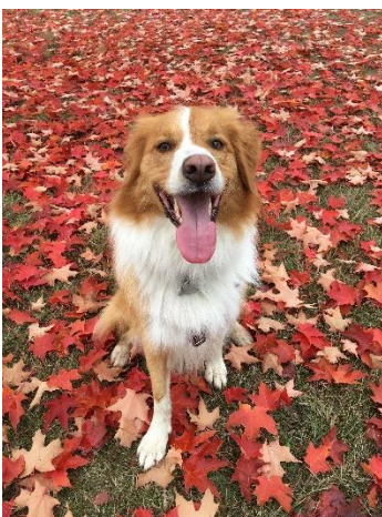
Second Place: “My Autumn Hiking Buddy”, photo, Janice Jenkins

I was immediately drawn to this photo as I glanced through the entries in this category. The colorful window against the gray and grainy building is a great contrast. I found myself looking closer to see the intricate features of the cracked wall echoed by the branches in the window.