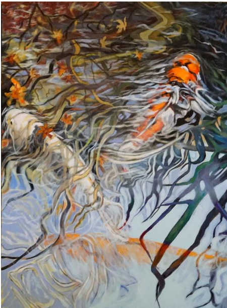
BEST OF SHOW: “A Consensus of Koi”, acrylics, Carol Sims

A beautiful digital treatment of a photo. I like the contrasting elements. Nice subtle coloring and use of blue on the insect.