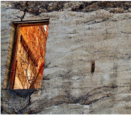
First Place: “Pop of Fall”, photo, Janice Christman

I was immediately drawn to this photo as I glanced through the entries in this category. The colorful window against the gray and grainy building is a great contrast. I found myself looking closer to see the intricate features of the cracked wall echoed by the branches in the window.