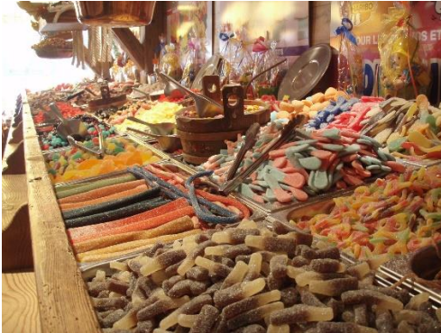
Third Place: “Sweets of Autumn”, photo, Carol Harris

I like your use of unconventional ingredients to express the Colors of Autumn. Good perspective. I'd like to explore the variety of sweet offerings displayed.